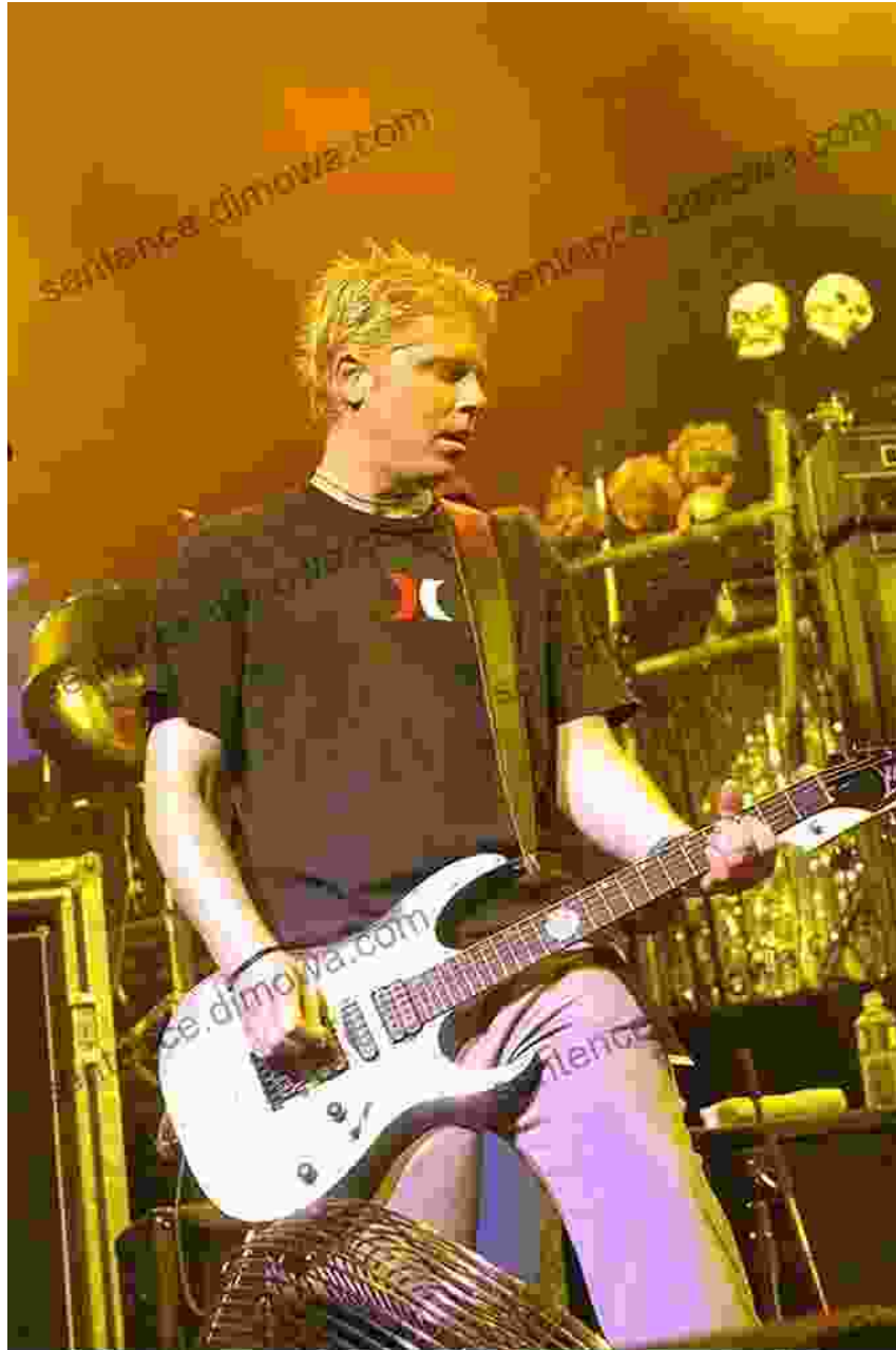
Dexter Holland embracing his acoustic side in his solo endeavors.