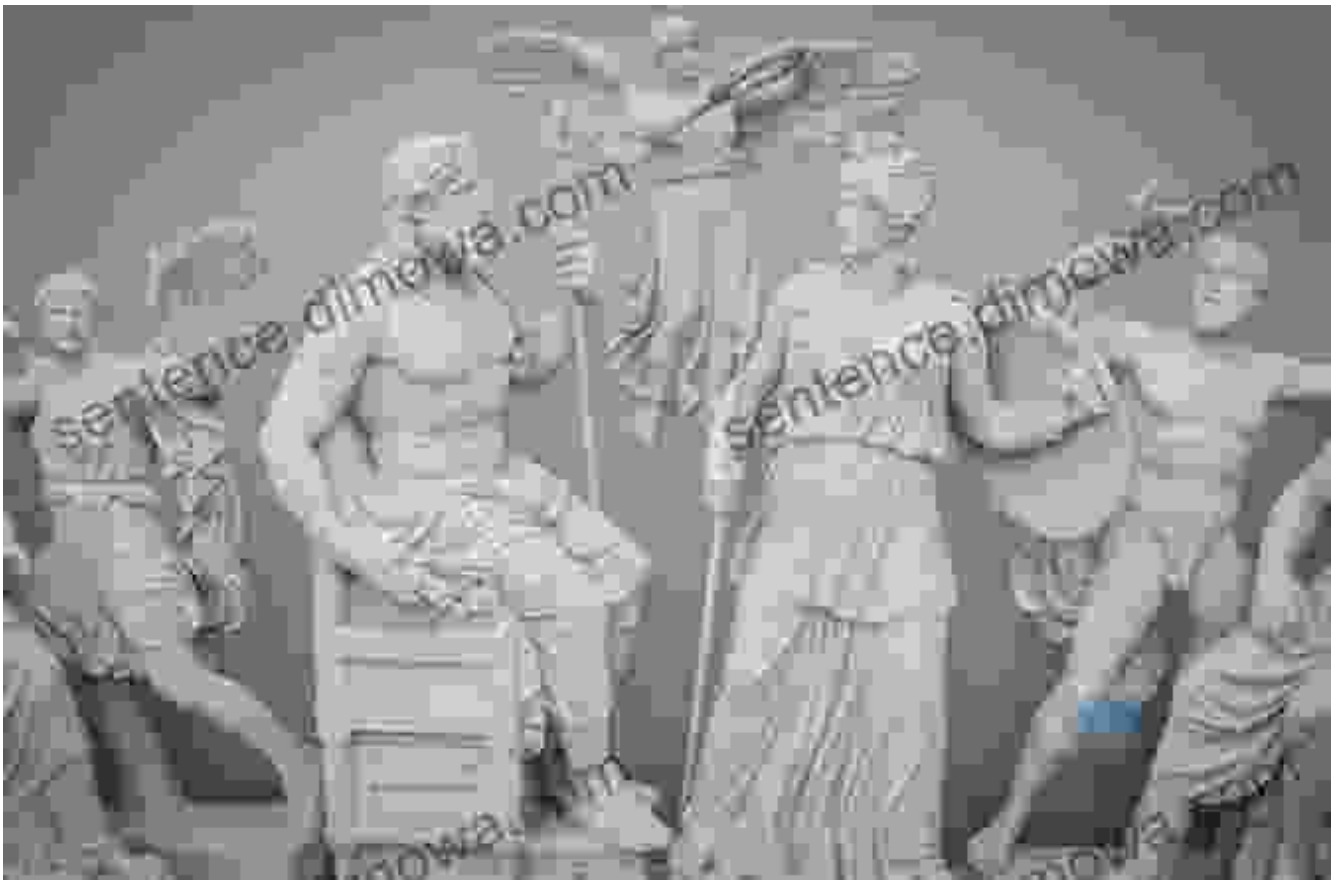
Pantheon of gods and goddesses, a gathering of divine beings from different cultures