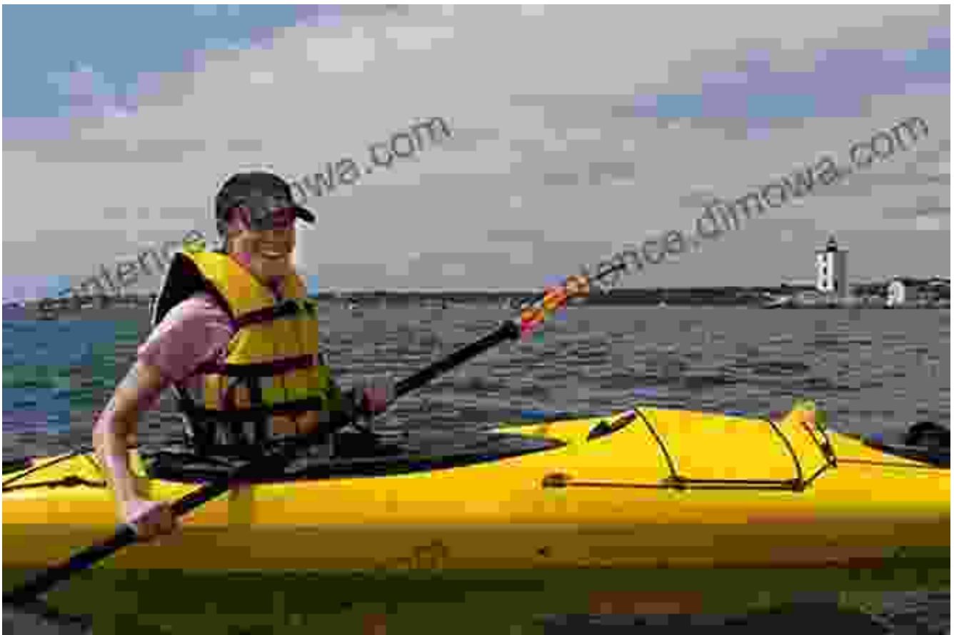
Narragansett Bay, Rhode Island

Rhode Island's coastline is a paddler's paradise, dotted with idyllic coves, secluded islands, and pristine bays. Embark on a kayaking journey through