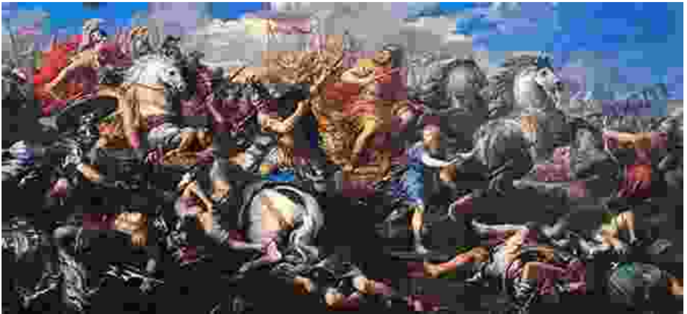
Anya and Darius fighting side by side in a fierce battle.