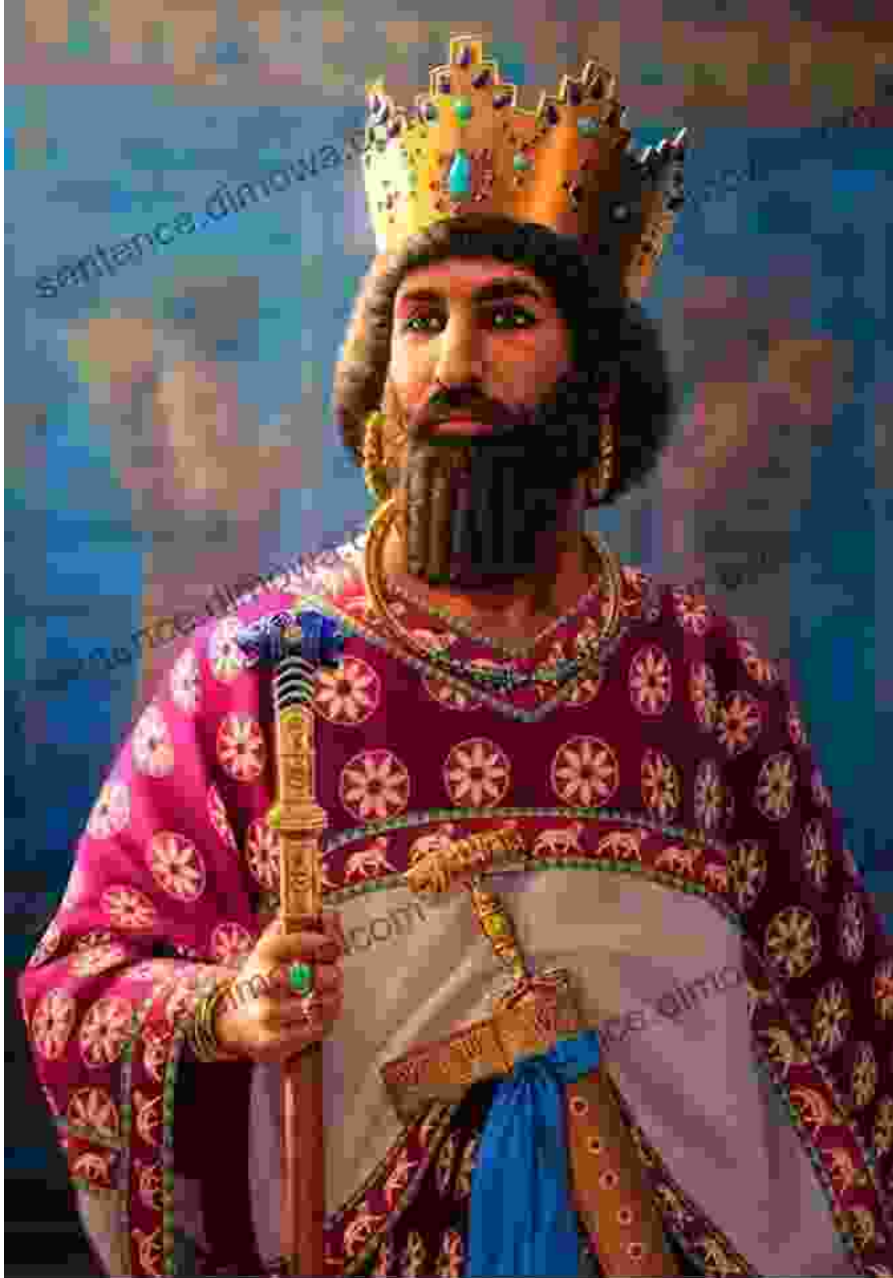
Darius, the skilled warrior and Anya's protector.